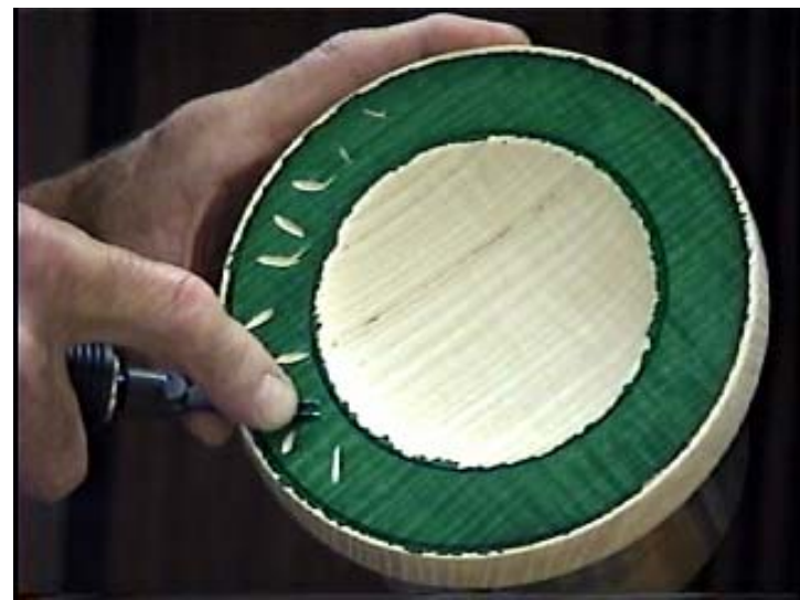
Ed did a some coloring & carving