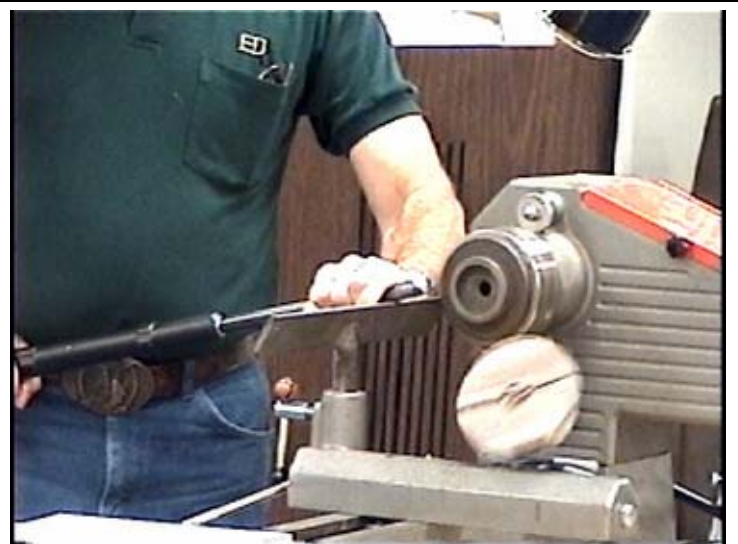
Ed's speedy method of removing a piece from the chuck