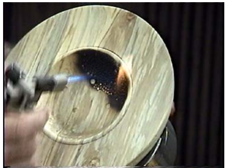
And some texturing & burning