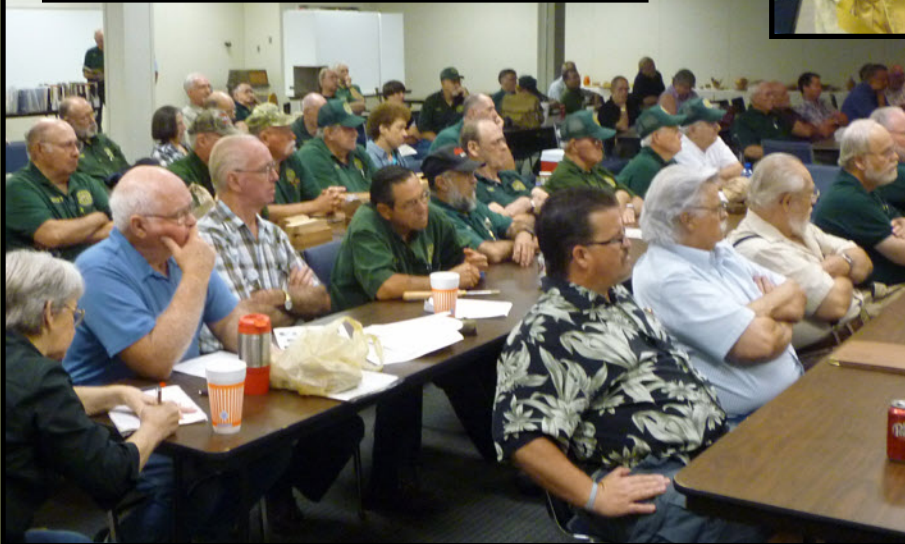
Smile....You're On Candid Camera