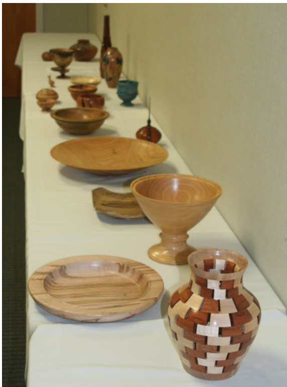
August Show and Tell Table