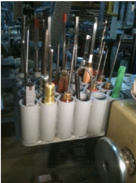
Fig. 2 - Mounted Tool Caddy With Tools

It attaches to this cage mount point thereby allowing the tool caddy to move with the headstock. (Fig 2).