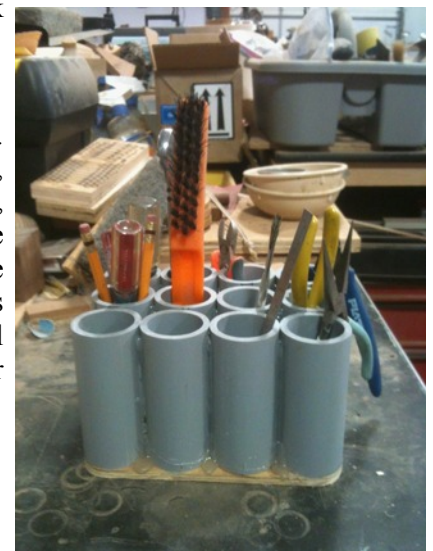
Fig 6 - Stand Alone Caddy

My "Studio" accent color is gray ☺, hence that is why I used the electrical PVC conduit. You could use white, schedule 40, PVC pipe as well. Canting the rack toward the turner, makes tool selection easier and placing the tallest tools in the back row, shortest in the front, adds safety. Having these small tools readily available at the lathe really helps while turning and the caddy is high enough that the headstock locking bar is reachable. The concept worked so well for me that I made several 2x5 arrays for use at other work stations in my shop where small tools are required – for example, my woodburning/rotary tool station (Fig. 6) and in my finishing room. Also, this concept could be adapted to other lathes for small tool storage solutions. – Paul Coppinger