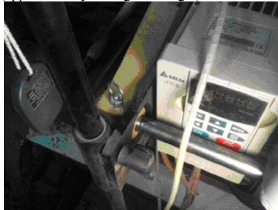
Fig 5 - Rod mounted into Mounting Point