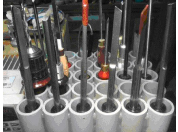
Fig. 1 - Tool Caddy

Many of us have Powermatic 3520A or B lathes and everyone I know with one immediately removes the cage that comes with the lathe. This leaves a nice mounting hole on the headstock behind the work area. This article describes an easy to make, cheap, tool caddy that hold 30 small tools (Fig. 1).