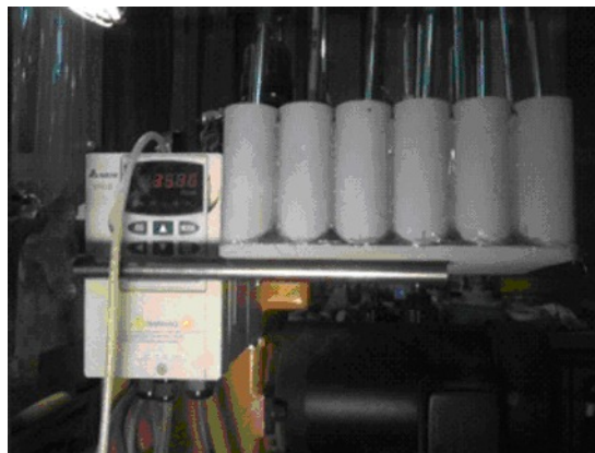
Fig. 3 - Rear View Showing Mounting Rod

It attaches to this cage mount point thereby allowing the tool caddy to move with the headstock. (Fig 2).