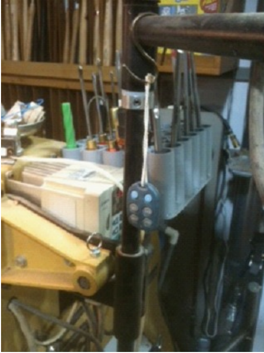
Fig 4 - Mount Point with Spring-Loaded Detent