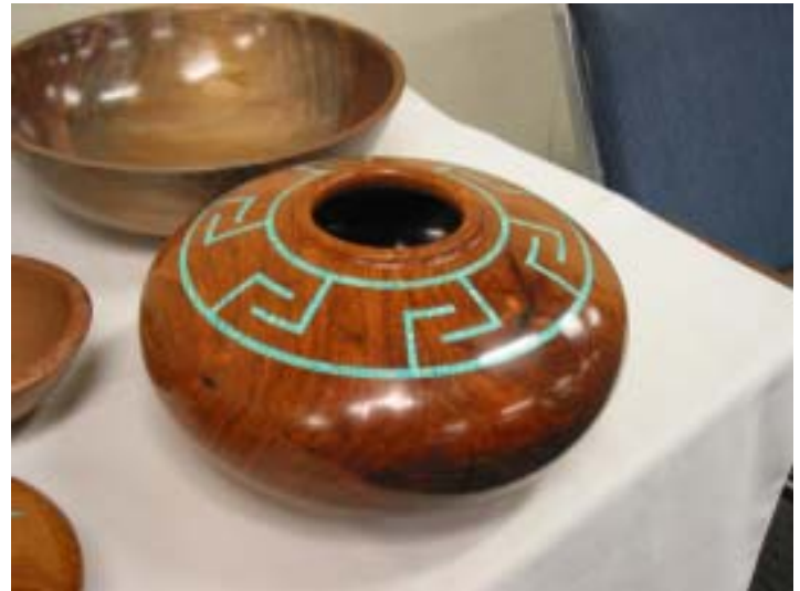
EDITOR'S SHOW & TELL FAVORITE Mesquite w/Turquoise vessell by Tom Criswell (another selection from the August meeting)

With cooler months approaching, let's get busy turning to help those in need. – Editor