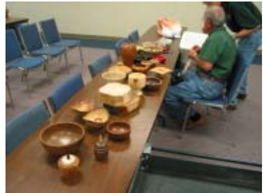
“EMPTY BOWLS” items for September.