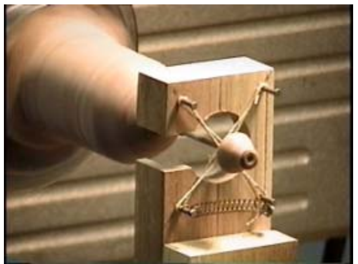
A closeup of Andy's string steady rest