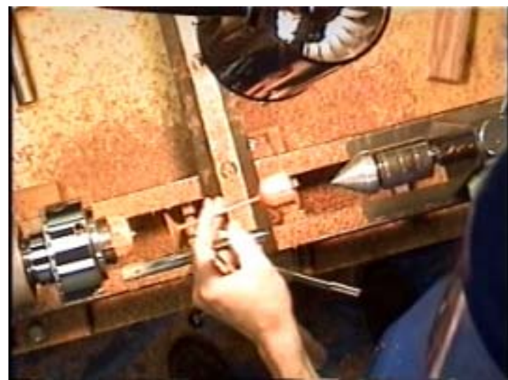
The finished Tulipwood goblet