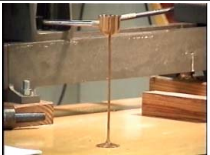
One of Andy's thin-stemmed goblets from Tulipwood