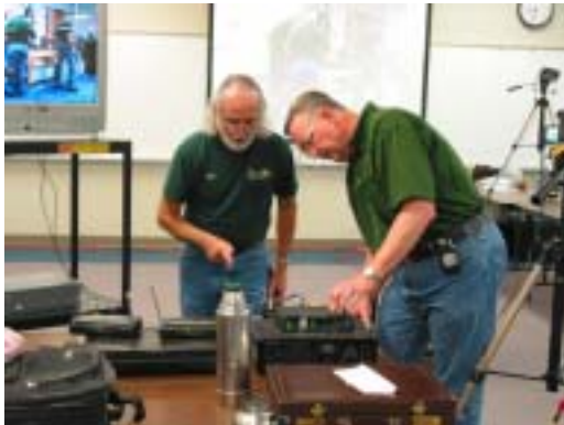
We all get a good seat in the demo thanks to these guys!