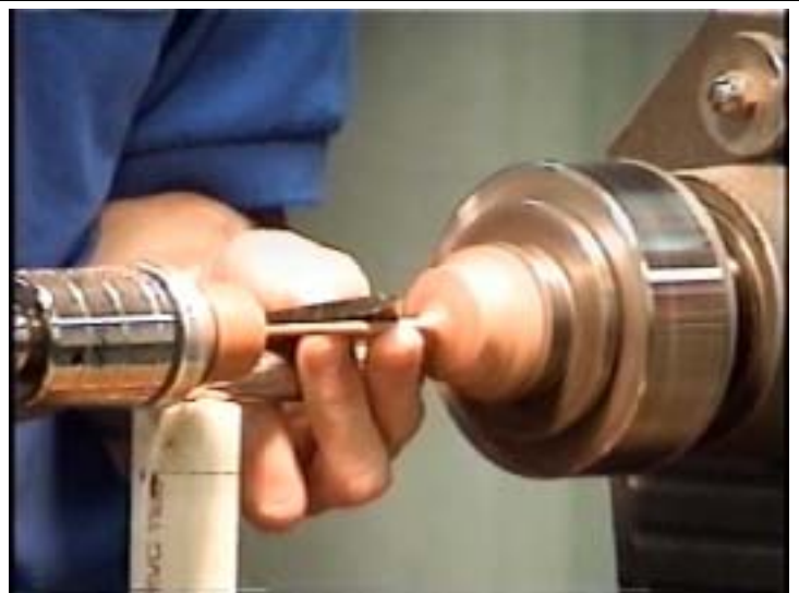
He used a very large skew to turn the thin stem