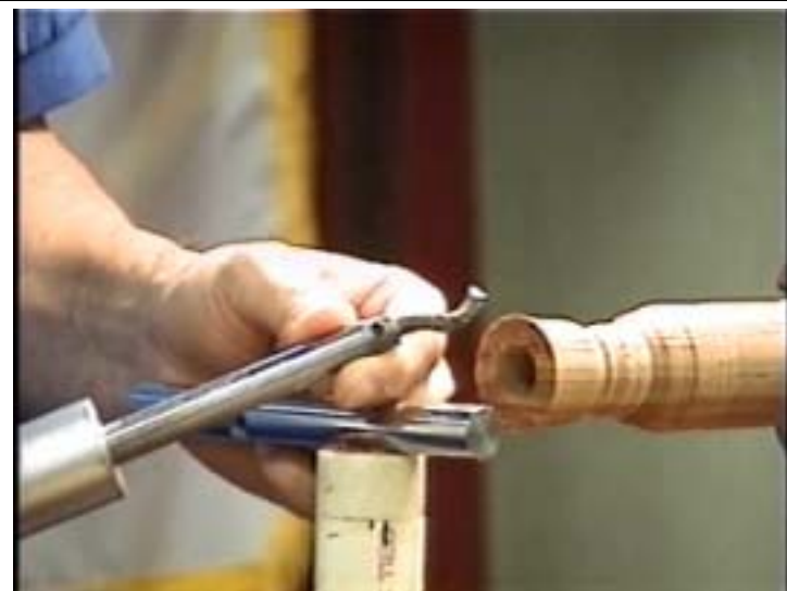
Andy used a Martel hook tool to hollow the goblet