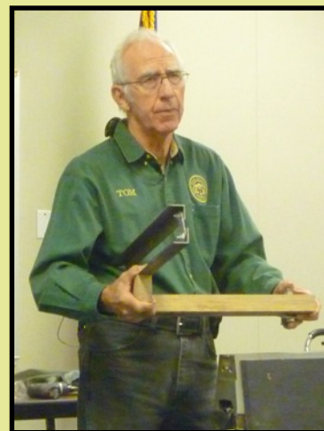
"Deep Hollowing System For A Mini-Lathe" By Tom Crosby