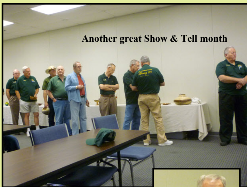
Another great Show & Tell month