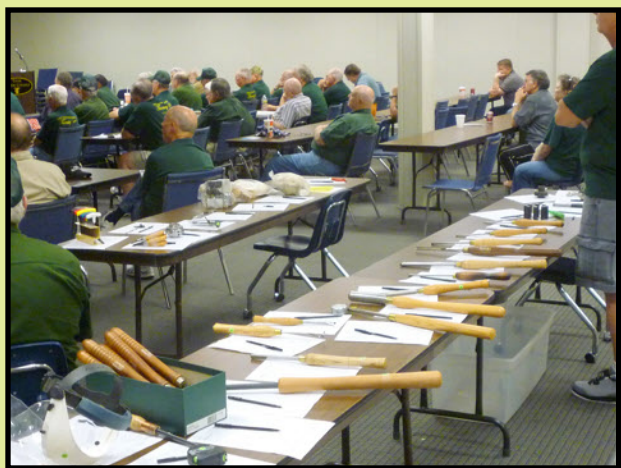
Another successful silent auction