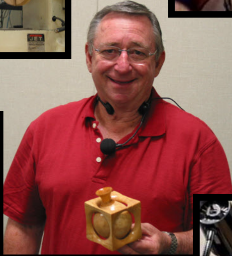
Vessell In A Box by Jimmy Arledge