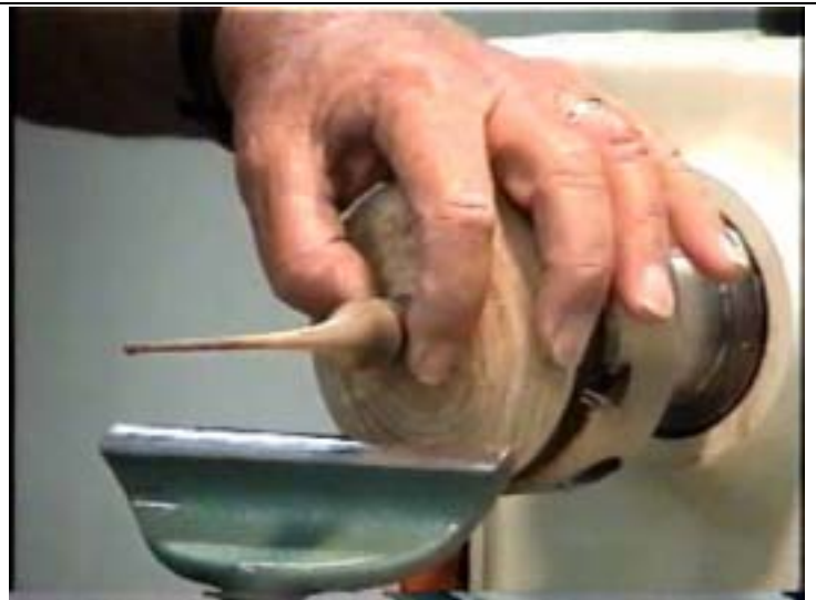
...and finally fits the turned finial to the top.