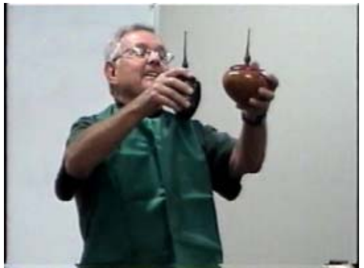
...showed us how he makes his beautiful finial boxes.