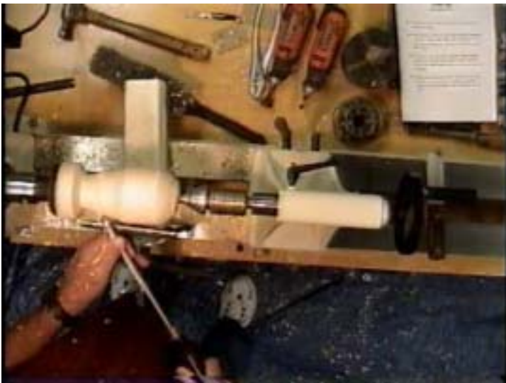
He begins by turning the body to shape....