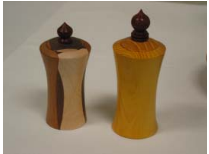
EDITOR'S SHOW & TELL FAVORITE Laminated and Osage Orange toothpick holders by Denny Burd

The October ETW meeting gave a big boost to the 2008-2009 Empty Bowls project with 27 pieces donated by 9 ETW members. To date the project has collected 69 items from 17 donors. There are approximately four months remaining to participate in the project; so, let's get busy turning to help those in need. – Editor ( who forgot to take a picture )