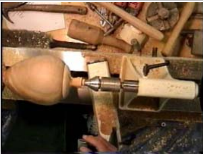
...reverses everything and completes the shape of the top...