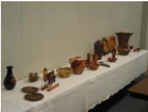
A few of the October Show & Tell items

For Sale: 1950 Craftsman 2-speed scroll saw. 24" throat; 16" x 16" table; 1/2 hp motor; shop made stand; original manual included. $125 Charles Brooks 903-216-5564