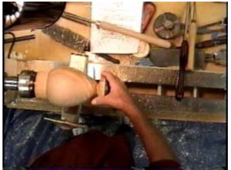
...then fits the top to the body...