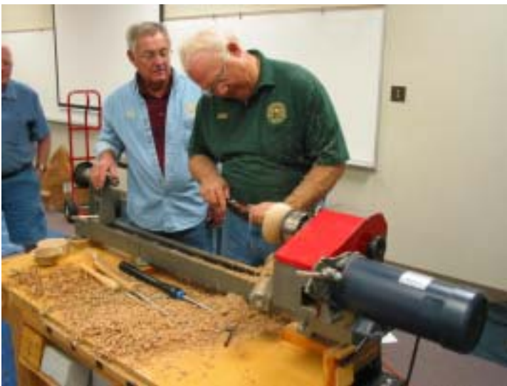
Making some chips fly