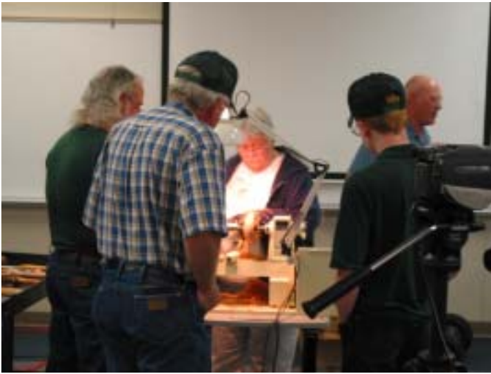
A first-time turner getting her feet wet