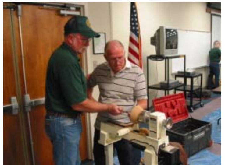
“Hands-on” instruction was common