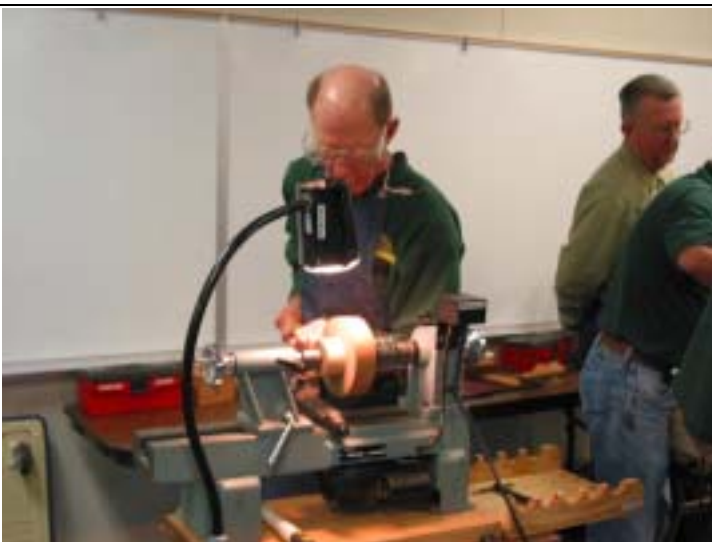
Possibly an “Empty Bowl” in the making