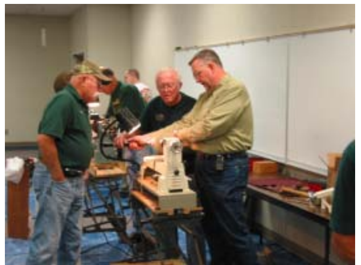
A good time to try something new