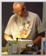
Click for more pictures