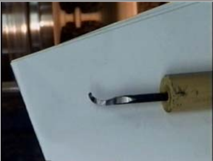
....Several special purpose tool, like this captured ring tool...