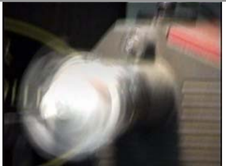
....And, as always, Tom was very entertaining 8-)