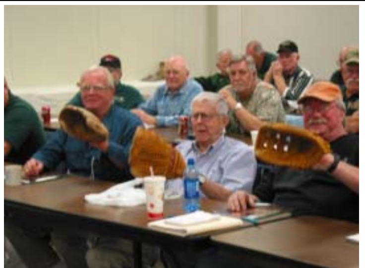
And these guys were prepared to catch it!