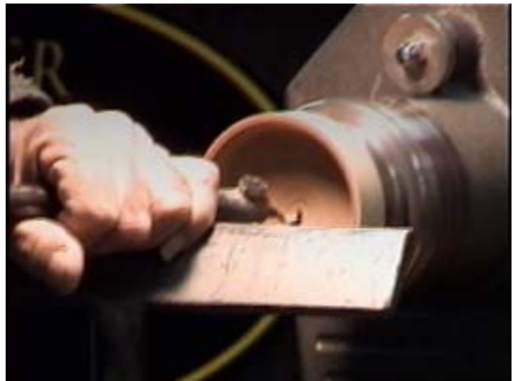
...Several methods of hollowing a box, like this hook tool...