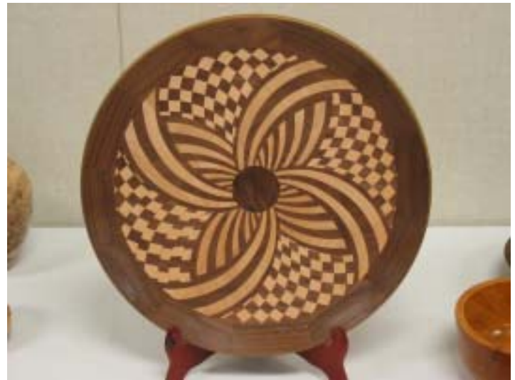
EDITOR'S SHOW & TELL FAVORITE Walnut & Burch Platter by Jim Goggans