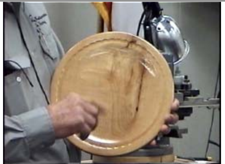
A Maple platter with Rose Engine rim enhancement.