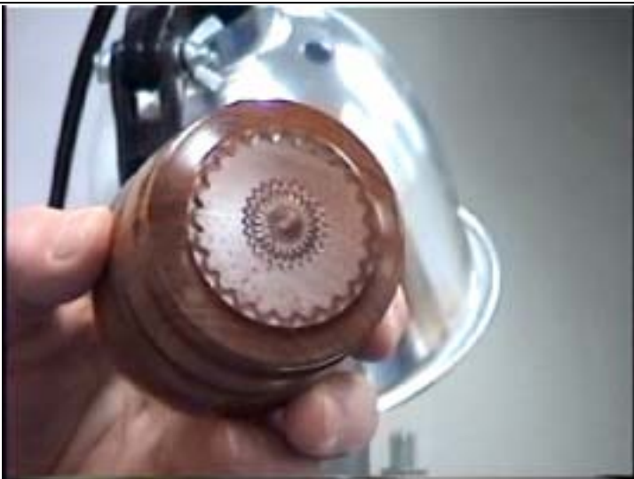
A Bubinga box showing Rose Engine enhancements.