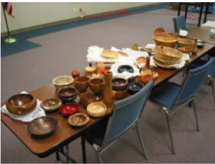
February was our biggest Empty Bowls month so far with 78 items donated, most of which are shown above.