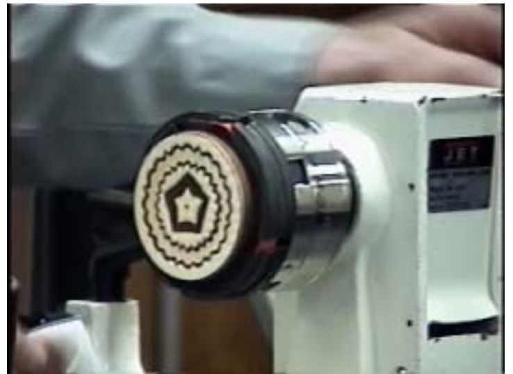
This design was done using two contrasting laminated woods.