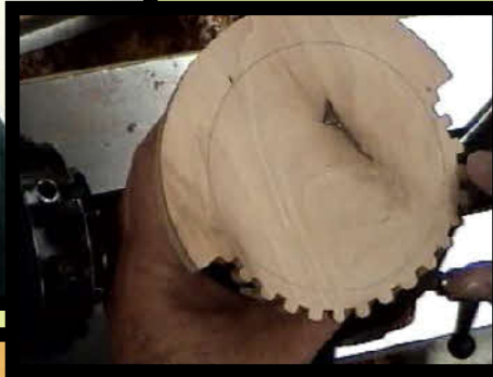
Creating Special Effects By Charles Brooks