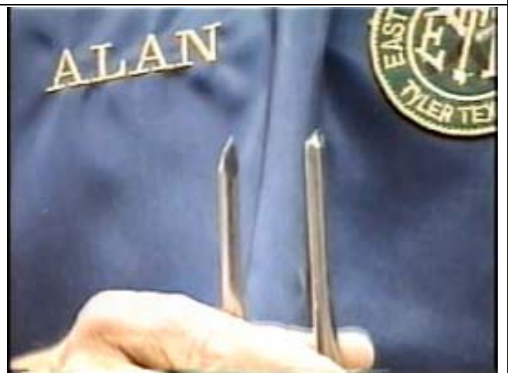
and the use and sharpening of various edge tool bevels.