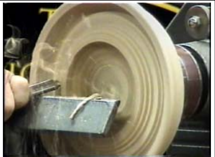
then removing wood from the inside of the bowl.