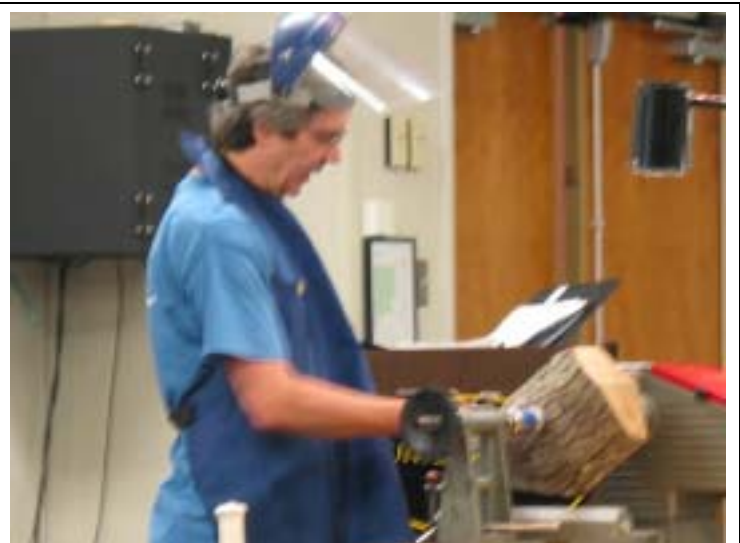
Preparing to turn a wet Maple bowl blank.