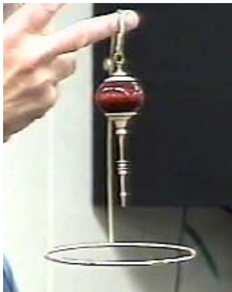
One of Alan Leland's beautiful and delicate Christmas ornaments.

Bandsaw For Sale: 10" Delta Bandsaw. Less than a year old. Complete with manuals, & 4 blades 1/8" to 1/2". $100 Casey Weldon, 903-765-2945