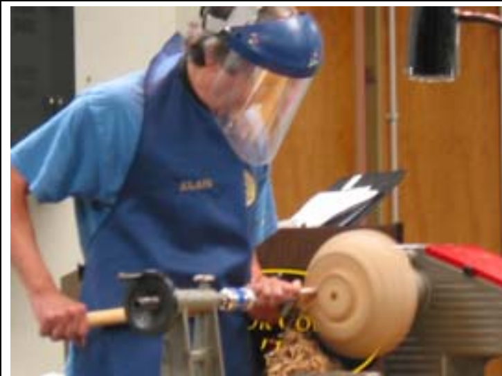
First shaping the outside of the wet blank....