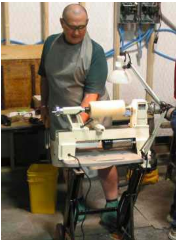
Who was that masked man, and why were his feet green?