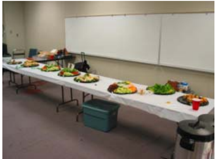
With even more good food on these tables.