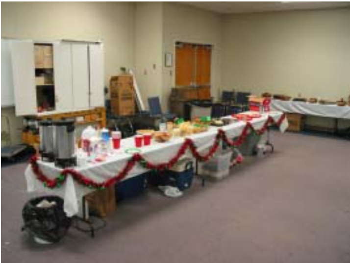
There was a lot of good food on these tables...