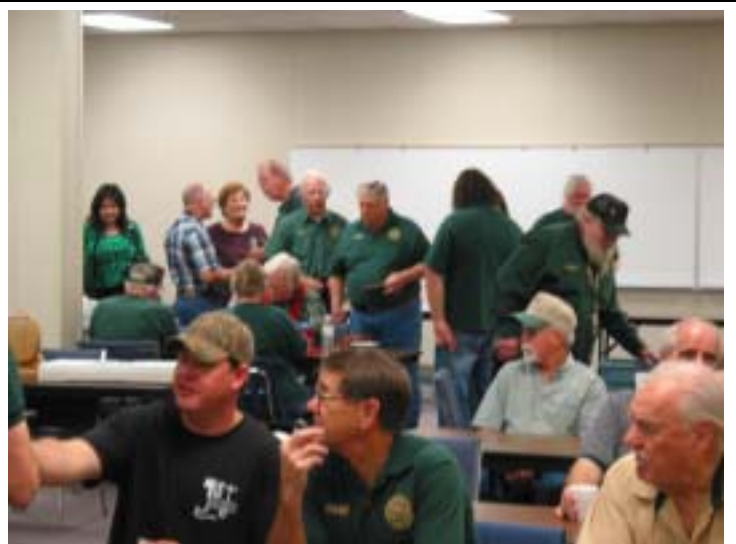
Ticket sales for the raffles was brisk