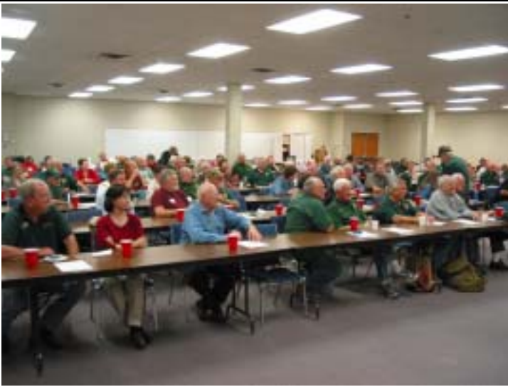
A great turnout for the club Christmas party.