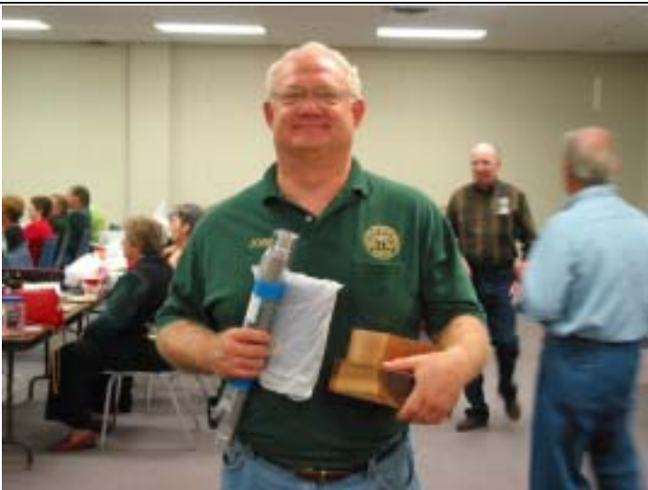
I think this guy should be banned from future drawings 8-)