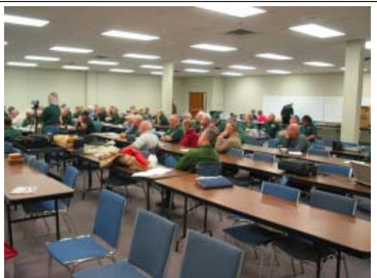
Between 70 and 75 members were in attendance.