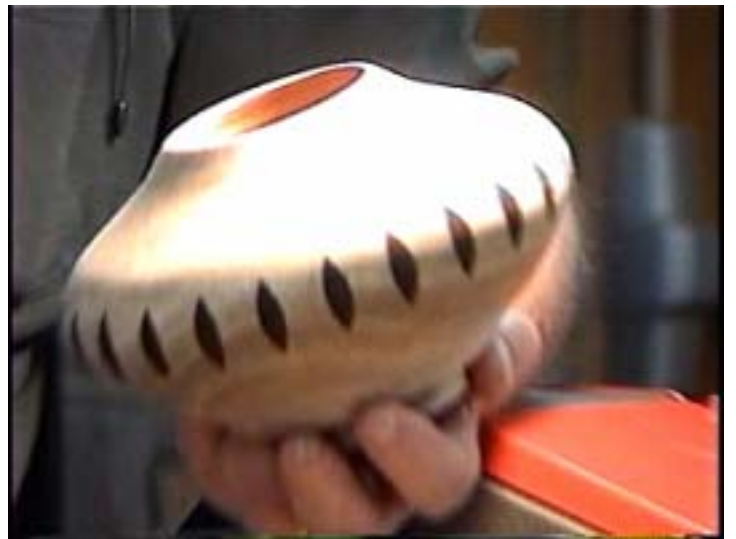
Another "work-in-progress" inlaid turning.