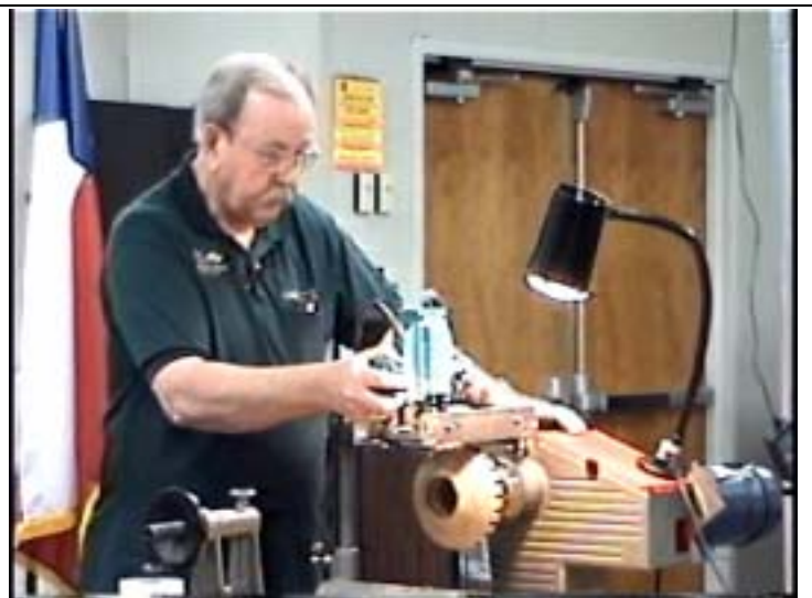
The routing jig for cutting the inlay recesses.