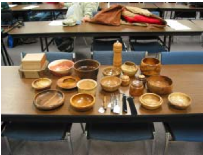
January was a good Empty Bowls month with 34 items donated, some of which are shown above. Several pieces were donated after this picture was taken.