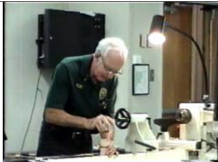
...and showed how to use a hammer that looked a lot like a four-jawed chuck