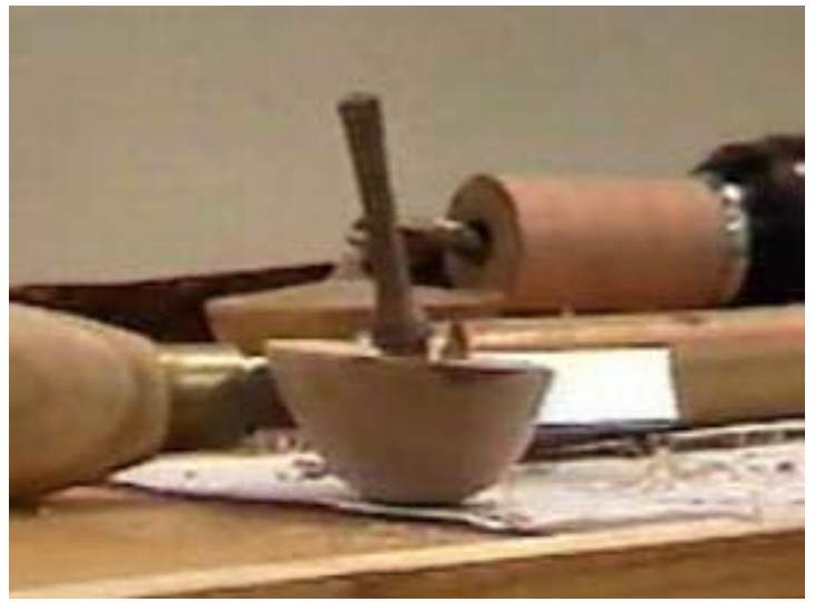
... a rather complicated and strange looking multi-axis box..