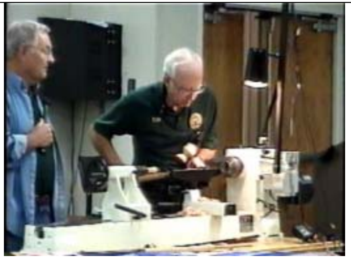
And no Crosby demo would be complete without some aerial shenanigans.