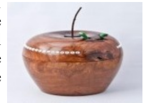
Kelvin Burton's 2011 Winning Entry

Don't forget to take your Beads Of Courage donations to SWAT later this month. Besides helping to brighten some sick youngsters day, you will have a chance to win some SWAT bucks to be spent with the symposium vendors. –