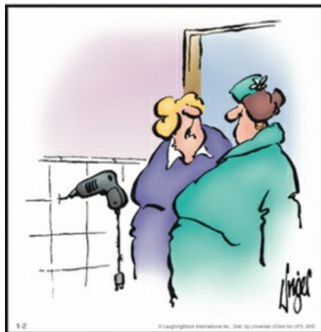
"Six years ago he started putting up a towel rack."